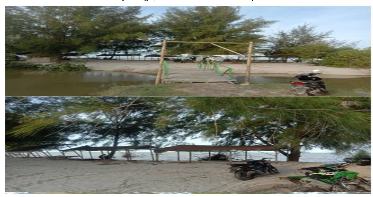
Figure 2. Mangrove Condition of Pari City Village, Mirror Beach

A condition that often occurs is the dependence of local people's lives on mangrove forests as their source of livelihood. Related to the description above, local community activities will eventually utilize mangrove forests in an environmentally unfriendly manner and the impact is that mangrove forests will be degraded and damaged, even these natural resources will become extinct. Actually, the local community already knows about the role and benefits of mangrove forests on their environment, but they have no other choice because to maintain their lives with their families, they must use the forest, so the damage to mangrove forests that occur in Pari City Village, Pantai Cermin District is quite a lot.