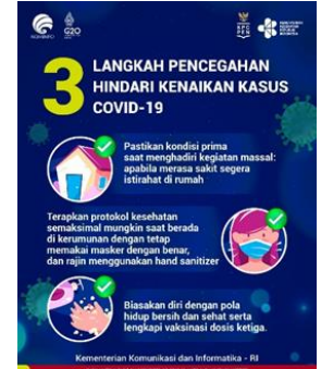
Figure 2. Frequently Encountered Government Appeals

Keeping your distance, washing your hands, wearing a mask are the words we have heard the most in the last 2 (two) years, when a pandemic caused by the SARS-CoV-2 virus or commonly known as Covid-19 occurred. COVID-19 is a virus that easily spreads through the air and frequently touched objects. To prevent the spread of COVID-19 from becoming more widespread, the Indonesian government always urges the public to always do 3M. The public is expected to always wear masks, keep their distance and not always touch objects in public facilities, because there is a high possibility of spreading the virus through these objects.