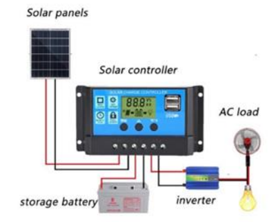
Figure 3. The process of converting solar energy into electrical energy

Solar panels are devices consisting of solar cells that convert sunlight into electricity. Solar panels produce direct current or DC electricity that can be used as a source of electricity. Solar panels are often called photovoltaic cells. Solar panels or PV cells depend on the photovoltaic effect to absorb solar energy and cause current to flow between two opposing charged layers. A solar panel is a semiconductor bed consisting of cells made of silicon material that can convert sunlight into electricity.