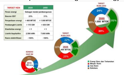
Figure 1. Primary Energy Mix Targets Based on KEN 2014

Indonesia as a country that has large natural resources, an area of around 1.9 million km<sup>2</sup> and a population currently reaching 267 million people with an average economic growth of 5% per year, is faced with a trend of increasing needs and energy consumption. Fossil energy, which has been the mainstay of energy consumption, has had an impact on the depletion of non-renewable natural resources and the increasing impact on environmental damage. This has prompted calls to limit the use of fossil energy and replace it with Renewable Energy. Utilization Renewable Energy which is clean and environmentally friendly energy (Clean Energy) has become a program of the Indonesian government and even the world. Indonesia has shown its commitment to reducing the impact of climate change by reducing the use of fossil energy and replacing it with Renewable Energy as stated in the KEN (National Economic Committee). Based on KEN, the Renewable Energy target is 23% in 2025 of the total primary energy of 400 MTOE and 31% in 2050 of the total primary energy of 1,000 MTOE. Advances and technological developments force us to think more creatively and innovatively, so that we can compete in realizing clean energy.