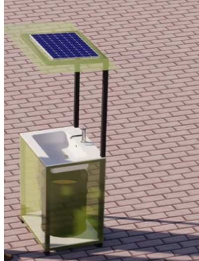
Figure 4. Solar Energy-Based Automatic Sink Design

The Automatic Sink Design can be seen in the following figure: