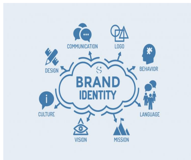
Figure 4. AIDA Concept

Building a Brand can't happen in one night. Brand Building is a long process to do to produce long-term relationships. Building a Tourism Village Brand is very necessary to face competition and introduce it to the public or tourists.