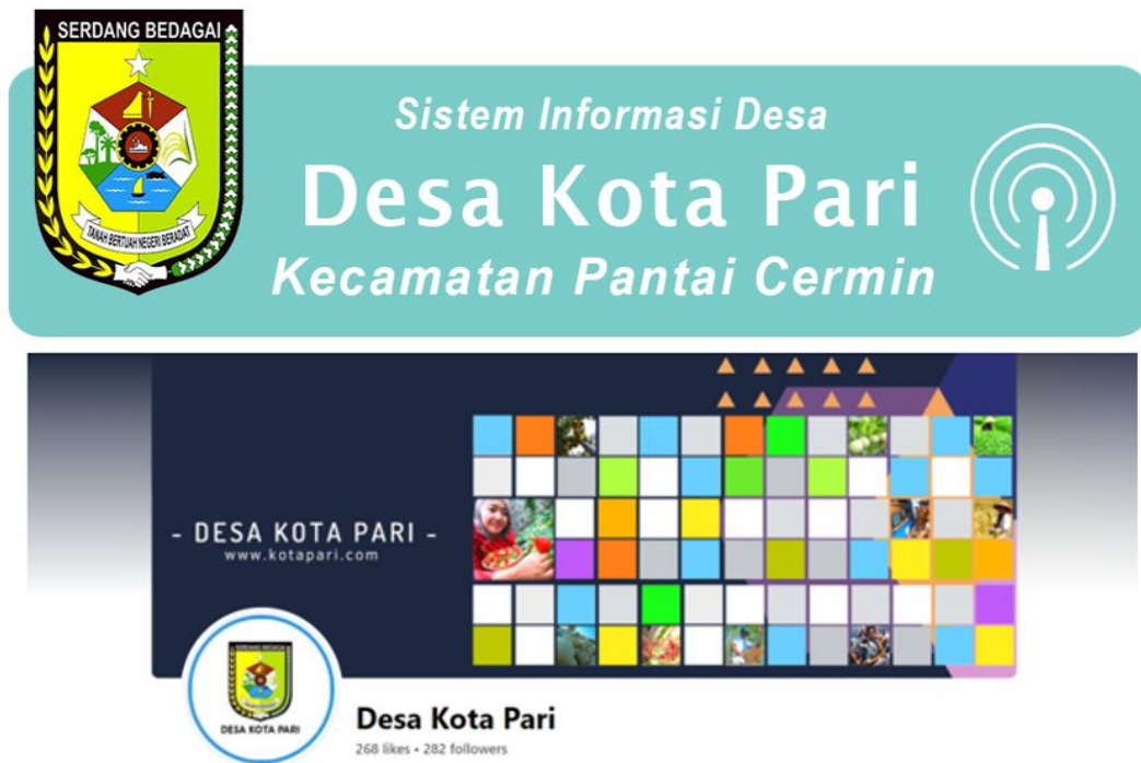
Figure 1. Website and Facebook of Pari City Village