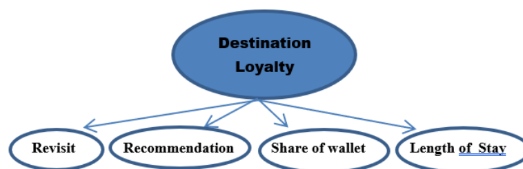
Figure 1. Destination Loyalty

Loyalty actually measures the love of tourists for tourist attractions, and explains the willingness of tourists to prefer destinations, for example the willingness and ability to pay more (Backman & Crompton, 1991). This is as stated by Ganesha et al (2000) that loyal customers will help a business by buying more, paying a premium price. As stated by Reicheld (2001) that loyalty is measured based on customer share of wallet, namely visitors will spend more money, and Length of Stay, or visiting longer in the same tourist spot compared to competing tourist attractions.