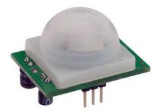
Figure 3. PIR sensor

According to Khoirum Muslihah (2015) PIR (Passive Infra Red) motion sensor is a sensor that functions for motion detection that works by detecting differences / changes in current and previous temperatures. The motion sensor using the pir module is very simple and easy to apply because the PIR module only requires a DC input voltage of 5V which is effective enough to detect movement up to a distance of 5 meters. When no motion is detected, the module output is LOW. And when it detects motion, the output will change to HIGH. The HIGH pulse width is \pm 0.5 seconds. The sensitivity of the PIR module which is able to detect movement at a distance of 5 meters allows us to make a motion detection device with greater success.