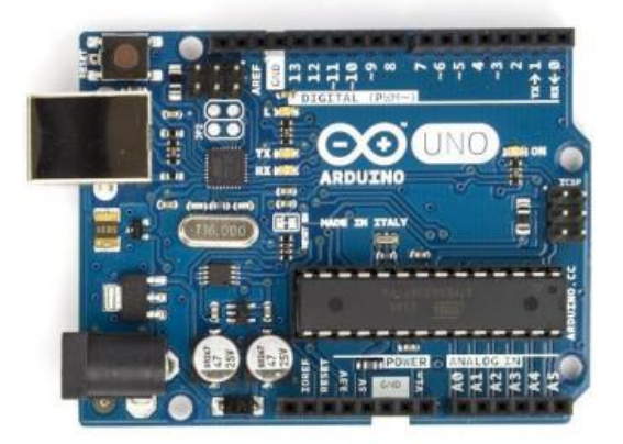
Figure 2. Arduino UNO ATmega328

According to Deni Dwi Yudhistra (2012) Arduino UNO is a microcontroller board based on the ATmega328 (datasheet). Arduino UNO has 14 digital input/output pins (6 of which can be used as PWM outputs), 6 analog inputs, a 16 MHz Crystal oscillator, a USB connection, a power jack, an ICSP header, and a reset button. Arduino UNO contains everything needed to support the microcontroller, it's easy to connect it to a computer with a USB cable or supply it with an AC to DC adapter or use a battery to get started.